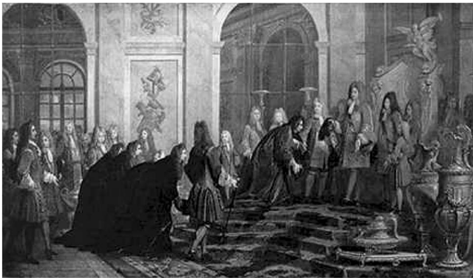
Marseille, musée des Beaux-Arts